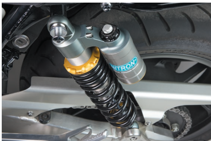
Fitting Image (HONDA CB1100RS /NITRON BLACK TWIN R3 Series)